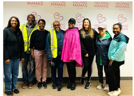
(November 11 th )

Our congregation has begun to partner with Helping Mamas on an ongoing basis. By working with them, we can have a great positive impact on our community, showing God's love for those in need and enjoying the teamwork of the Kingdom at the same time! Please keep your eyes open for emails about upcoming volunteer opportunities with this nonprofit source of help for families in difficult circumstances!