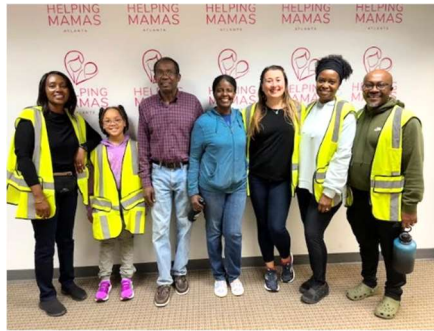
(October 14 th )