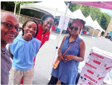
(from the August volunteer opportunity)