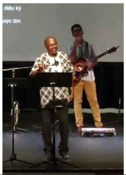
điêu ky lyc tim