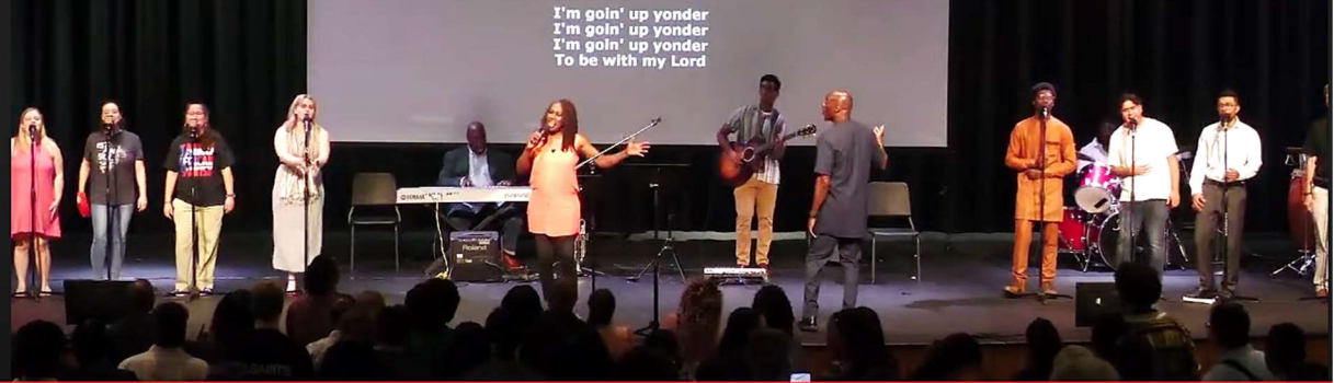
I'm goin' up yonder I'm goin' up yonder I'm goin' up yonder To be with my Lord