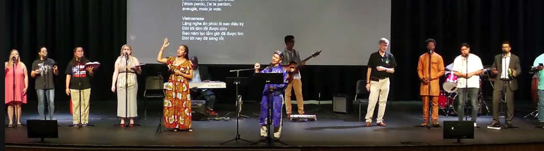
pour moi, pêcheur, qui crois, fais-toi pêcheur, fais la passion, avouglé, mais je vois. Vietnamese Lặng nghe ân phước ô sao diệu kỳ Đôi tai làm tôi được cứu Bao năm lạc lầm giờ đã được tìm Đôi tai này đã sáng rồi