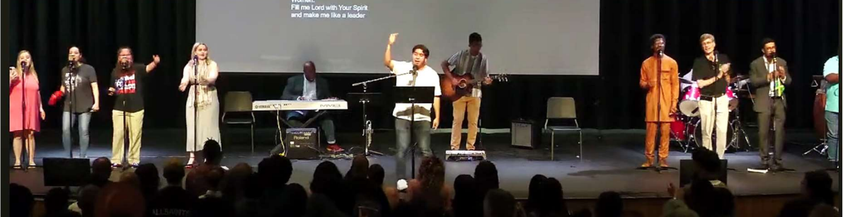
Women: Fill me Lord with Your Spirit and make me like a leader